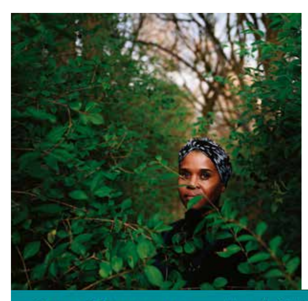
Brontë Parsonage MUSEUM

Residents living in BD20, BD21 are BD22 are eligible for a Local Resident admission rate of £7.50 with proof of address. Tickets are valid for 12 months after issue, meaning visitors can return and continue to enjoy the Museum as the exhibits change throughout the year.